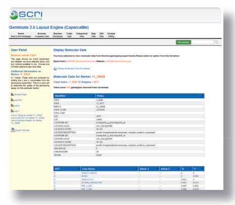
Marker Information All information that we have for a particular marker is displayed together.

Information sources for markers are brought together in one place including both internal and external data sources.