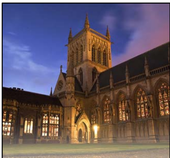
St. John's Chapel was built in 1280 on the former site of the home of the Augustinian Hospital of St. John.