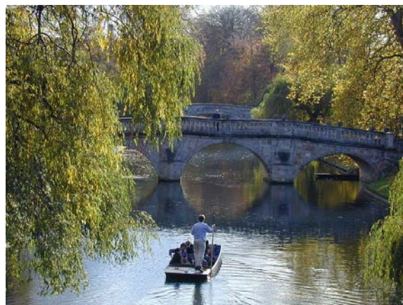
Punting in flat-bottomed boat, resembles a Venetian gondola

Following the workshop session field trip(s) are scheduled. The field trip(s) will provide delegates with an opportunity to interact in an informal setting on a professional and personal level. Cambridge is a cultural city with many attractions including world-renowned museum, fantastic theatres and beautiful architecture and scenery. Field trip(s) will be arranged so that delegates may part take in activities including punting and walking tours. Further information on things to see and do in Cambridge may be found at http://www.visitcambridge.org/ .