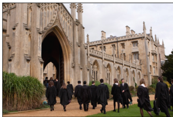
Student graduation 2010

pursue studies in environmental forensics. Student abstracts submitted for the conference as posters or for technical session presentations on an environmental forensic topic will be evaluated by a conference committee. Awards of $1000, $500 and $250 (US) will be presented for three best student poster session abstracts or technical presentations. Students are encouraged to submit technical manuscripts for publication the RSC Conference Proceedings. Further details on submitting a student abstract may be found at www.rsc.org/inef .