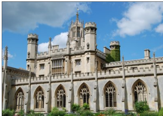
New Court, St. John's College in Cambridge

Two days of technical sessions will feature selected presentations on environmental forensic topics solicited from international leaders in the field. Selected speakers will submit manuscripts summarizing their papers that will be peer-reviewed prior to publication by the Royal Society of Chemistry. Copies of the proceedings will be provided to all conference attendees following the conference.