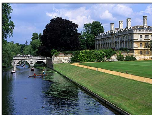
St. John's College in Cambridge was established in 1511