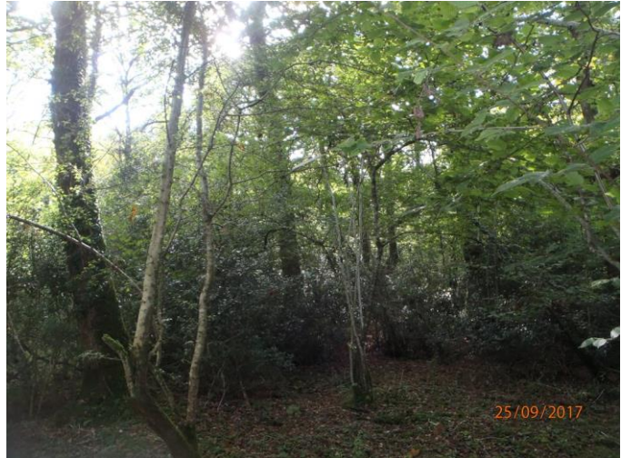
Dense understorey of hazel, holly and ash at Britty Common