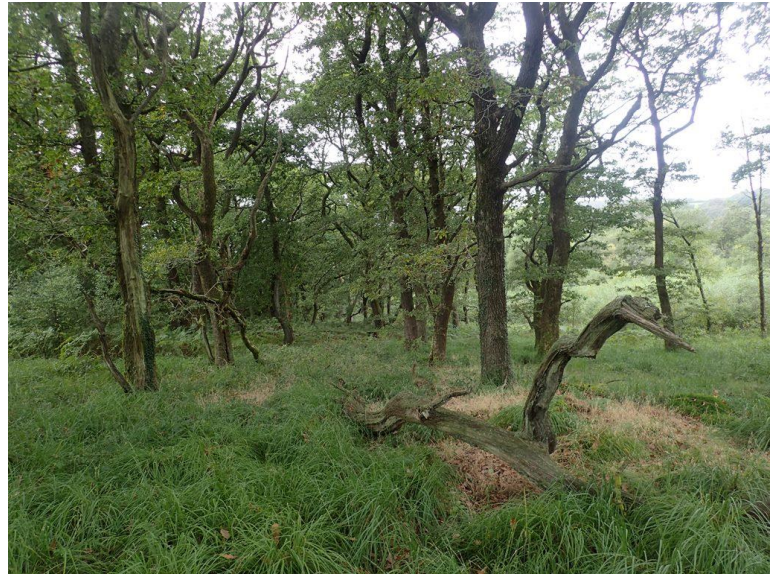
Pure oak overstorey and purple moor grass ground vegetation at Coed y Rhaiadr