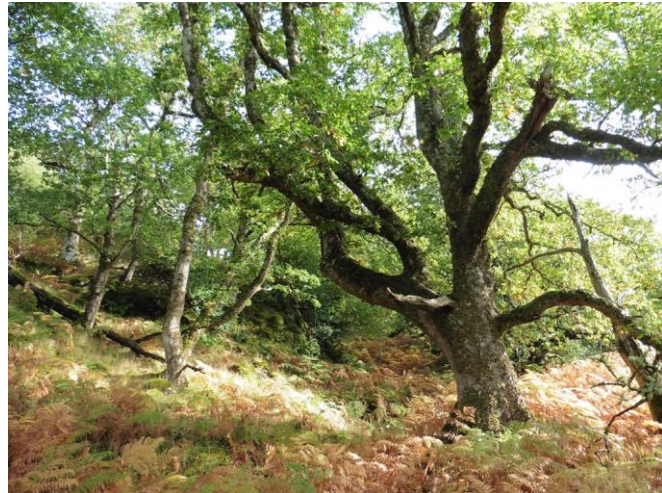
Oak and birch overstorey with developing understorey at Coille Dhubh