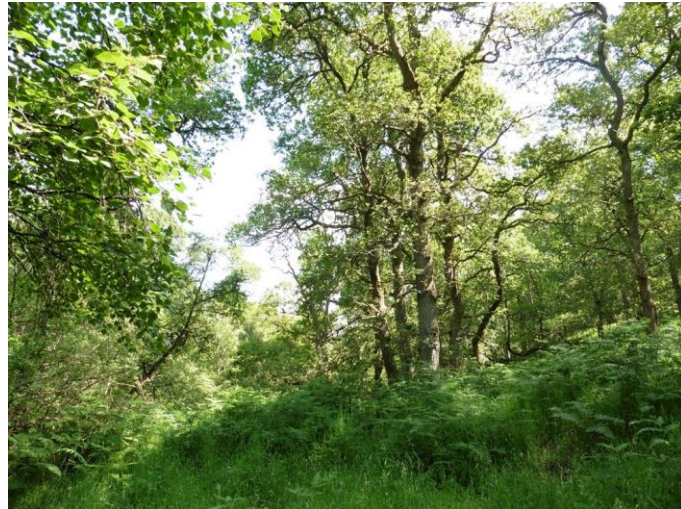
Oak dominated overstorey with ground vegetation of bracken and grasses at Dinnet Woods