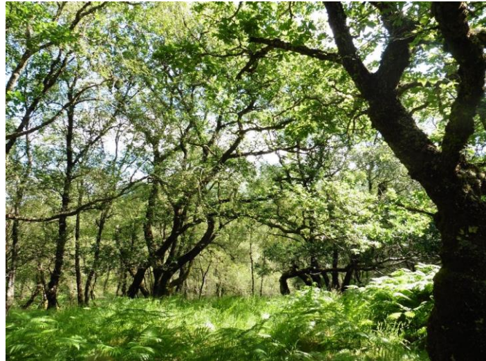
Mixed native broadleaved woodland at Glen Nant