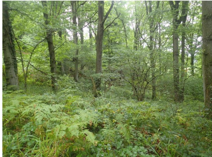
Canopy of mixed oak, ash and other broadleaved species at Hendre