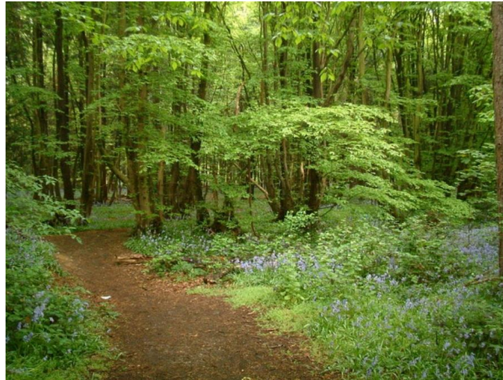
Oak dominated area of Monks Wood with bluebell ground flora