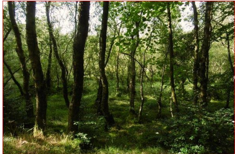
Oak, birch and sycamore at Mugdock