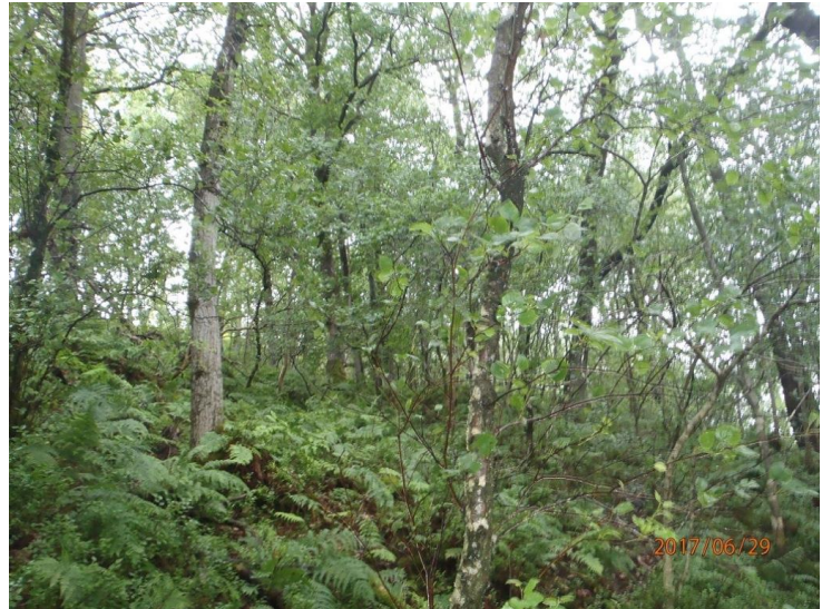
Regenerating broadleaved species at Rain Dale Wood