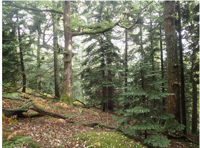
Oak overstorey and underplanted noble fir at Rhayader