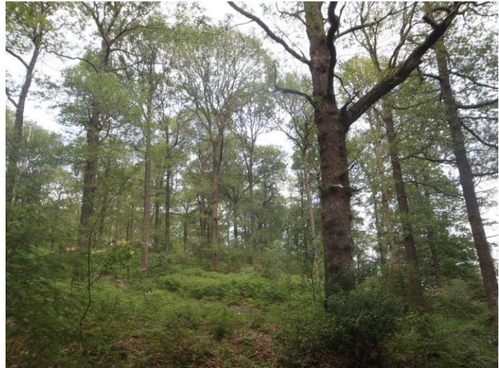
Pure oak overstorey and developing mixed species understorey at Scale Green