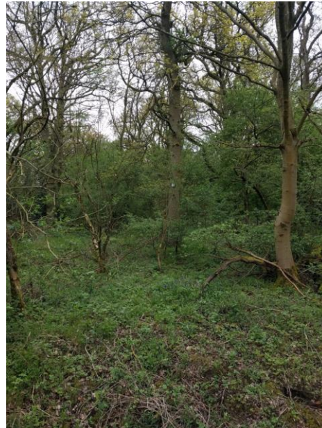
Mature oak trees in Stratfield Brake woodland

• = current case study site X = other case study site