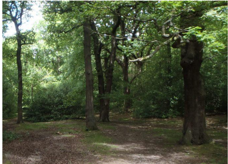
Predominantly oak overstorey with holly understorey at Sutton Park