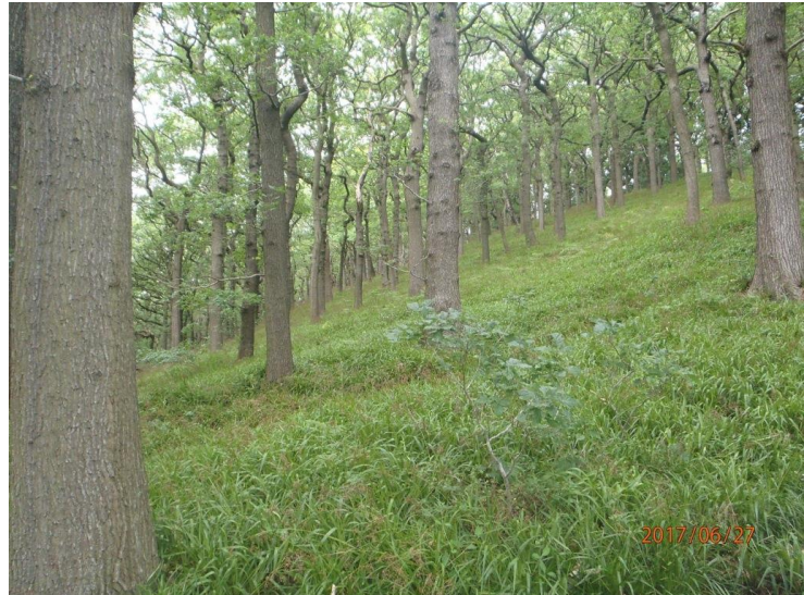
Totley Wood with ground vegetation dominated by Luzula and occasional oak regeneration.