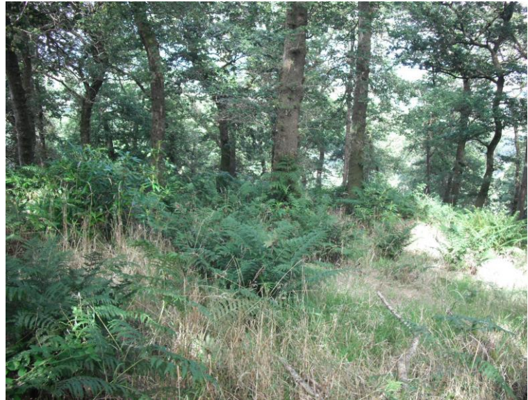
Oak woodland with bracken and grass ground vegetation at Tower Wood