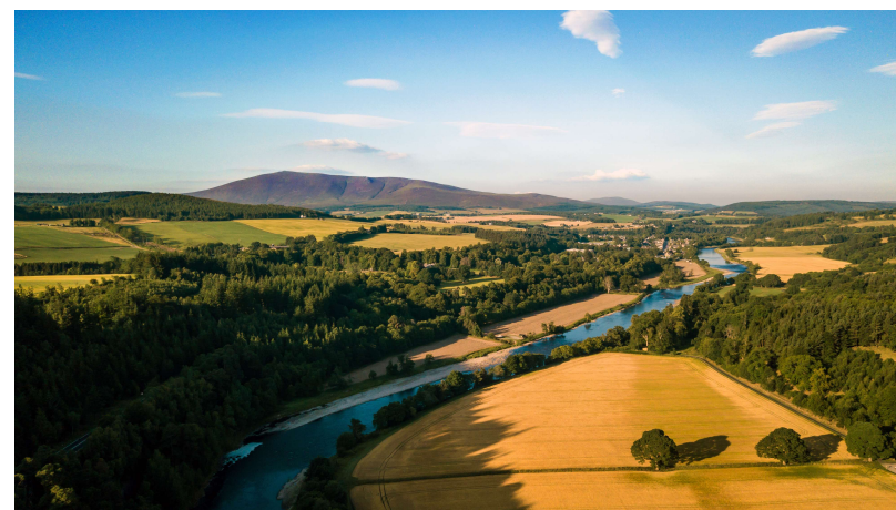
River Spey