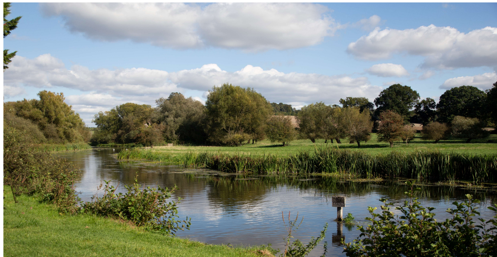
River Avon