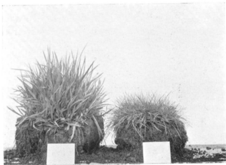
Broad-leaved erect type.