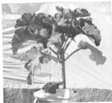
FIG. 3 Marrow-stem Kale, Line M 11. Stem stout; leaves curved, large; margins somewhat curled.