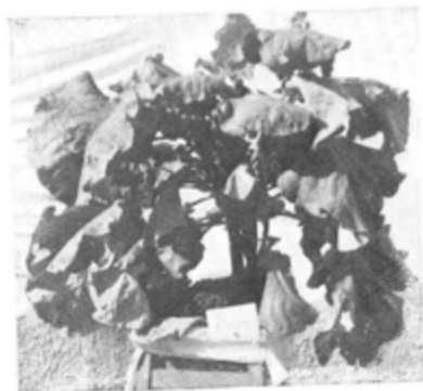
FIG. 5. Thousand-headed Kale, Line T 5. Leaves drooping, broad; margins somewhat curled.