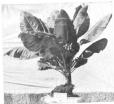
FIG. 6. Thousand-headed Kale, Line T 1. Leaves erect, oval; margins plain.