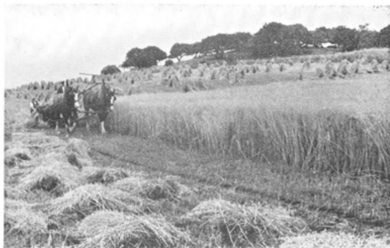
FIG. 1. A heavy crop of Early Miller oats being cut at East Craigs, Corstorphine, 1937.