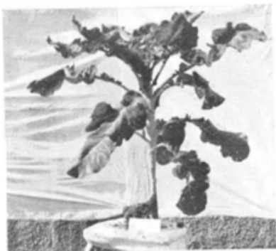
FIG. 4. Marrow-stem Kale, Line M 6. Stem long; leaves rigid; margins somewhat curled.