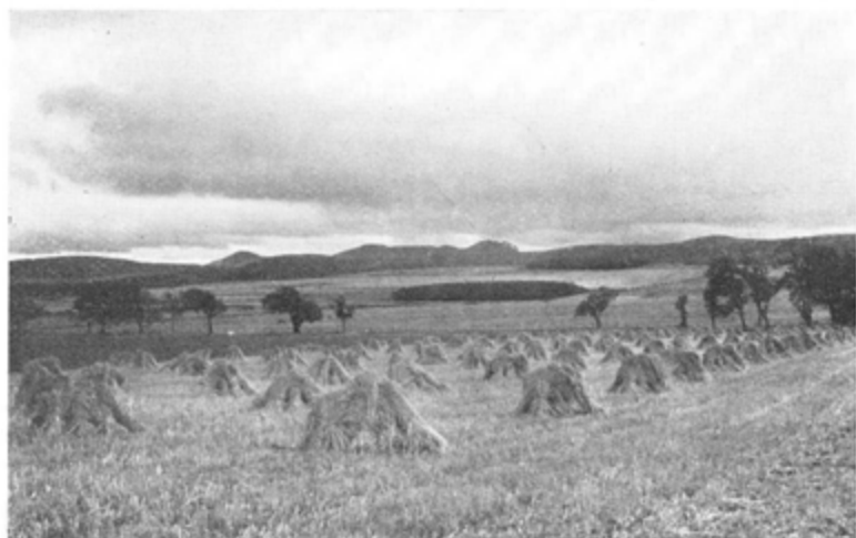
FIG. 2. Trial-plot of early-ripening oat, No. Aa 683, at Ainville, Kirknewton, 1937. Elevation of field about 900 feet above sea level.