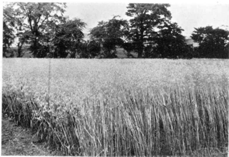
FIG. 1. Plot of Aa 698 Oats. At Plant-Breeding Station. 1946.