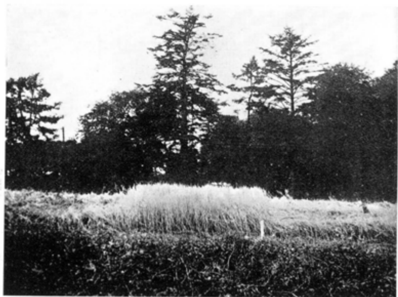
FIG. 2. Part of Oat Trial Plots, Craibstone, 1946. Aa 708 standing, other varieties lodged.