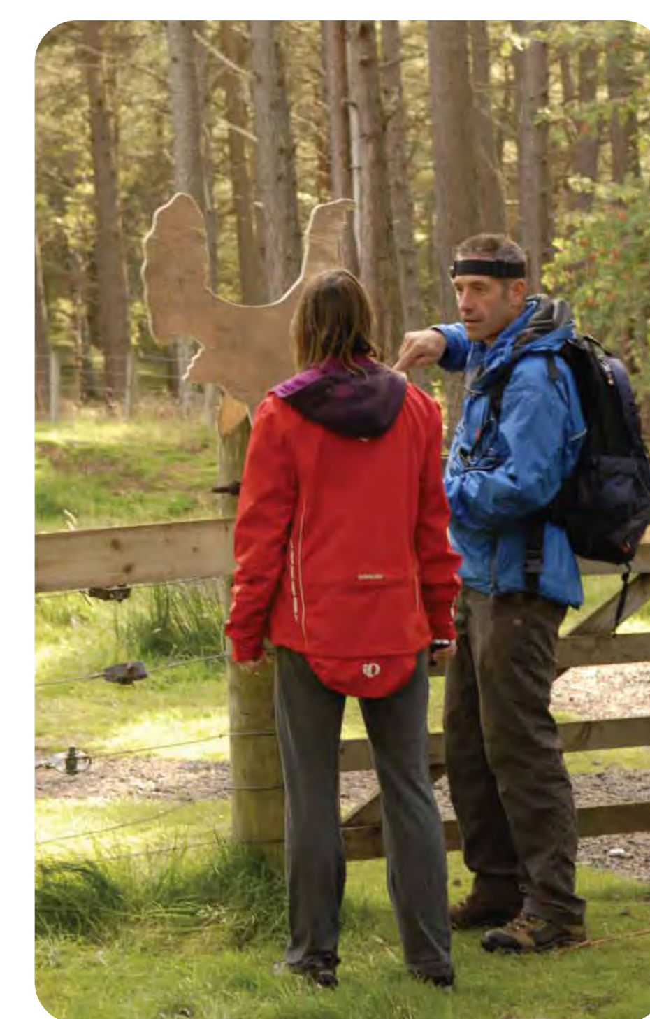
Using Mobile Video Ethnography with local ranger

Analysis of scientific, policy and media documents.