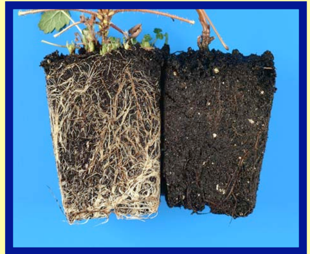
Latham and Glen Moy after inoculation with raspberry root rot

Genetic resistance exists in North American cultivars eg. 'Latham' exhibits field resistance to root rot.