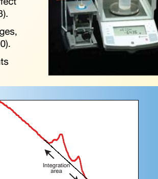
Figure 1. Aliphatic C-H peaks, integration area.

Aliphatic C-H groups were quantified through IR spectroscopy, with DRIFT spectroscopy detecting C-H stretching absorbance between 3000-2800 cm<sup>-1</sup> (Figure 1). Water repellency and sorptivity was measured using a miniature infiltrometer (Hallett and Young, 1999).