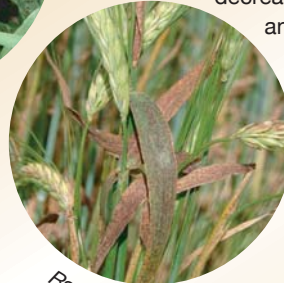
Ramularia Like Spots

Previously, “target spot” was thought to be the result of a physiological reaction and the necrosis associated with the mlo powdery mildew resistance thought to be the cause of a yield decrease in cultivars carrying the gene. Target spot and similar leaf blotches generally appear between GS30 and GS50 but the mlo flecking can be more prevalent post anthesis. We have used two doubled haploid populations, one of which segregated for mlo to study leaf spots in spring barley. Those spots developing pre-anthesis were classified as physiologic spots (PS) and those post anthesis as Ramularia Like Spots (RLS).