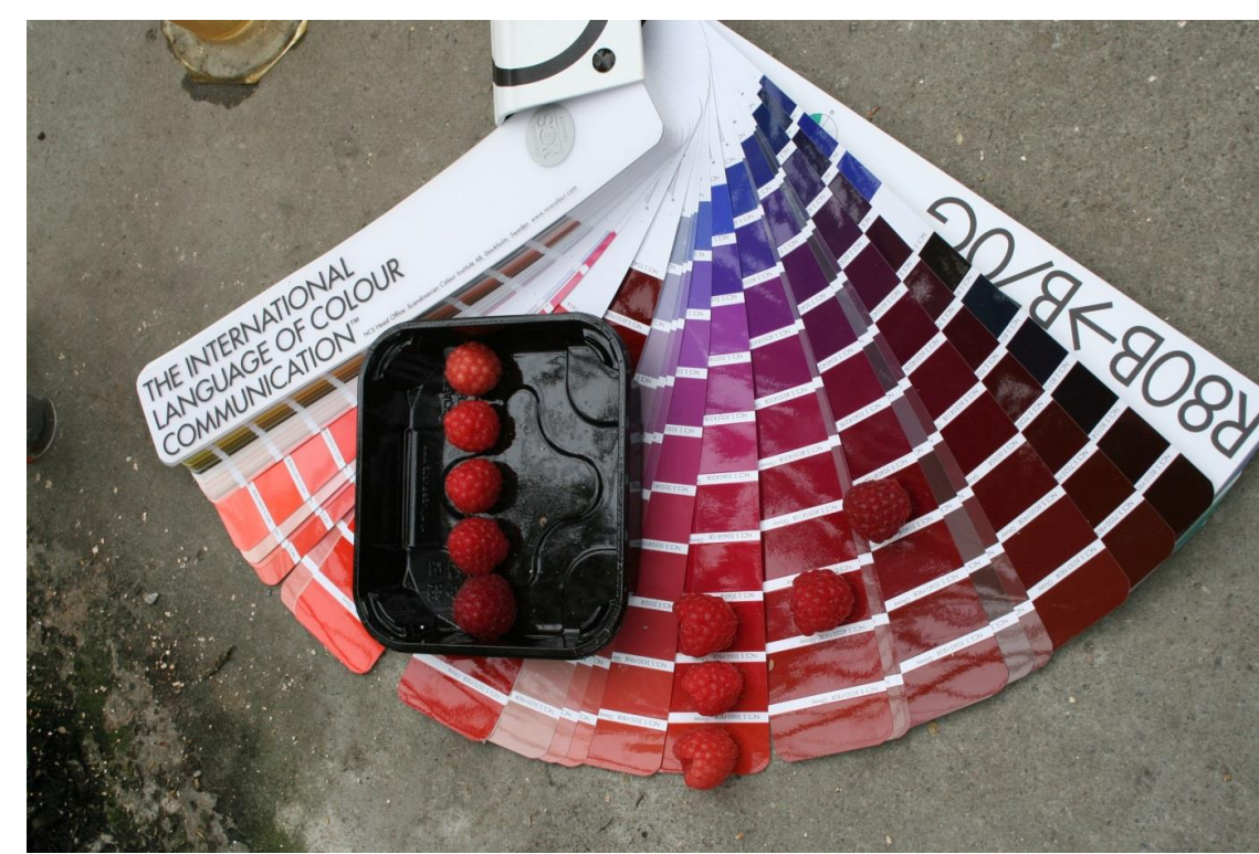
Figure 1: Colour Scale

Raspberry plants ( Rubus idaeus L. 'Glen Ample') were produced and cultivated in a greenhouse at a commercial grower's nursery on the west coast of Norway during the Spring 2011. Five berry colours along an assumed maturation gradient were identified according to the natural colour system (www.ncscolour.com) and used as a reference during the picking. Colours ranged from orange/red (colour 1), light red (colour 2), red (colour 3), dark red (colour 4) and dark red/ lilac (colour 5, Figure 1). After harvest, raspberry fruit were stored in a dark, cold room (2-3°C) for 1 day or 8 days until subsequent physical (fresh), sensory and chemical analysis.