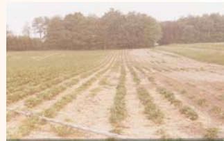
Strawberry red stele in S. Germany

dissemination. Provision of disease-free planting material would provide the ultimate control measure as land remains free of contamination. DNA-based diagnostic methods has enabled the development of rapid and sensitive tools capable of detection very low levels of Phytophthora contamination. SCRI has developed such a method and validation and exploitation in a Scottish disease survey is reported on this poster.