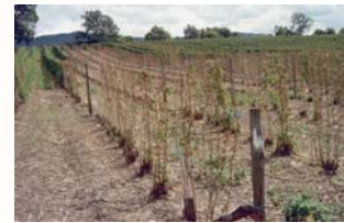
Raspberry root in Scotland.